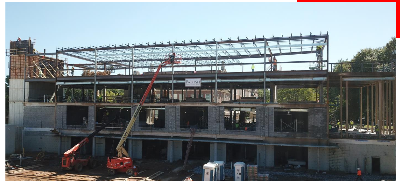
New Addition Progress