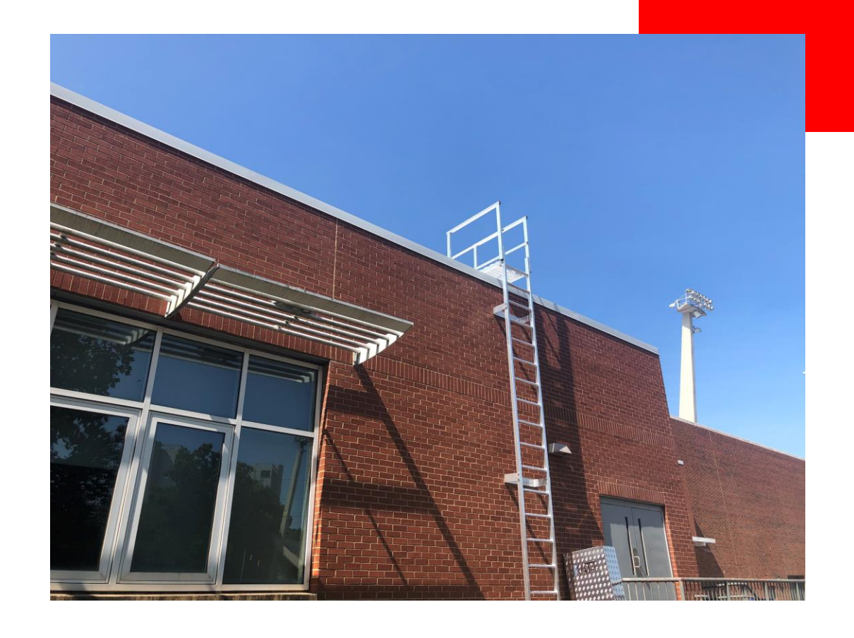
Roof Ladders Installed At Existing Buildings