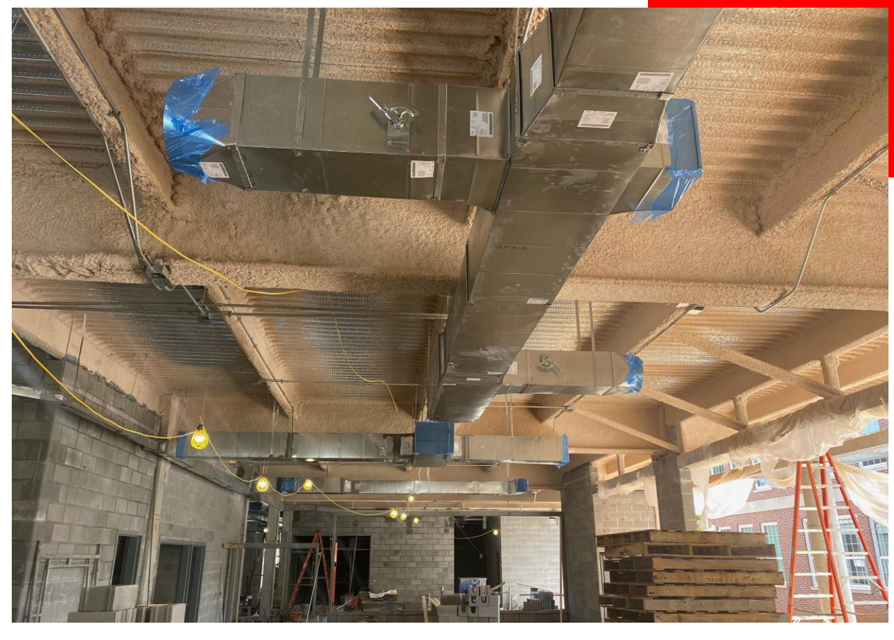
2<sup>nd</sup> Floor MEP Overhead Progress